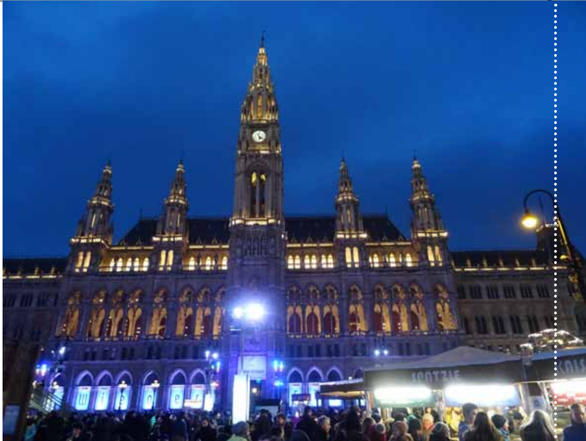
PHOTO CREDIT: ALFRED LEX, WIEN, 1. BEZIRK (THE ART OF VERY HISTORIC PLACES IN THE CORE OF DOWNTOWN VIENNA), RATHAUSPLATZ/UNIVERSITÄTSRING (VIENNA ICE DREAM 2017 (BURGTHEATER AND TOWN COUNCIL), REVE SUR LA GLACE, SUEÑOS SOBRE HIELO, I SOGNI DI GHIACCIO VIENNESI)*