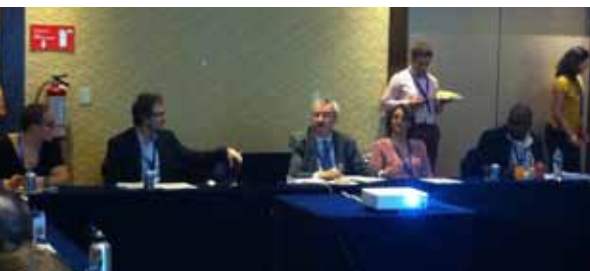
SCBD organized side event on Risk Assessment of LMOs