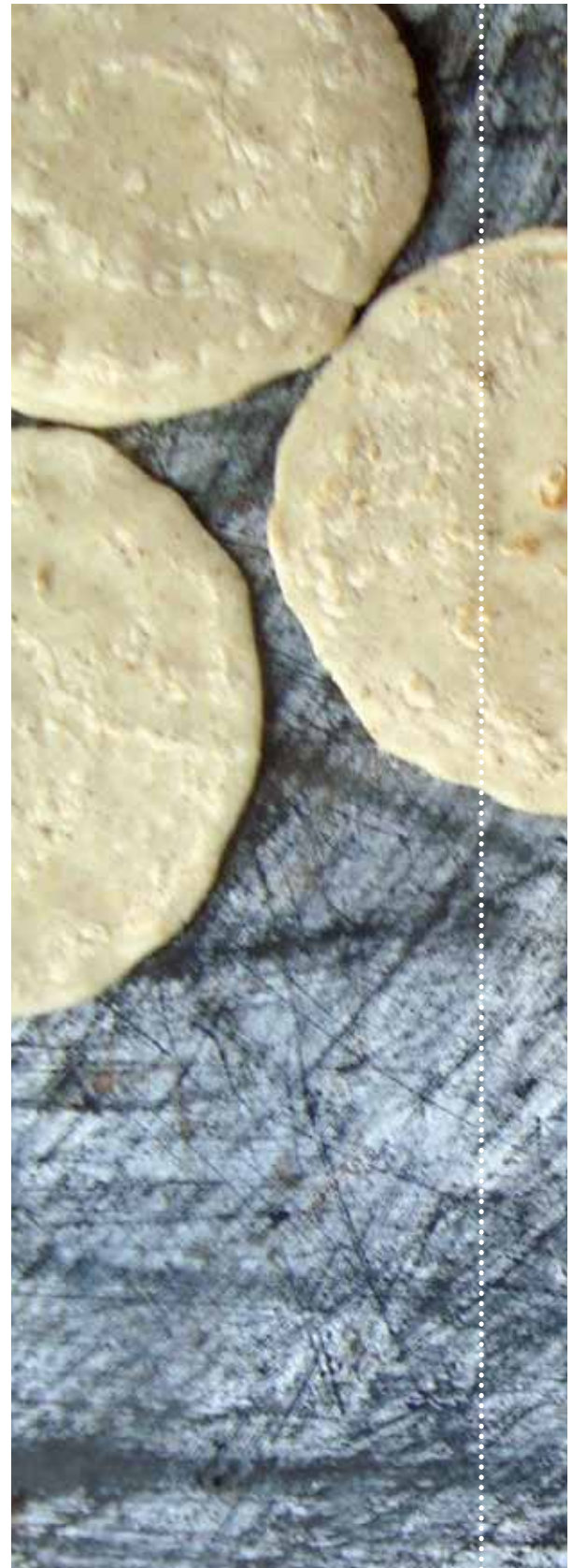
HANDMADE CORN TOITILLAS GUATEMALA