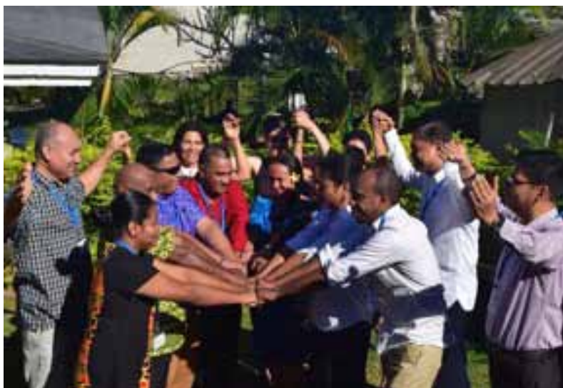
BCH Pacific Regional Training Workshop for Biosafety

From 20 to 23 June 2017, the Pacific Regional Training Workshop for Biosafety Clearing House (BCH) National Focal Points was convened by UN Environment, in collaboration with the Secretariat, and brought together the National Focal Points to enhance the capacities of Pacific Island nations to effectively participate in the BCH as part of the BCH III project. By the end of the workshop, participants unanimously agreed to the “One PASIFIKA Biosafety Roadmap”, a navigation tool for island nations to effectively put in place biosafety measures beyond the BCH III project. This roadmap consists of four main components: enhancing capacity, establishing sustainable administrative systems, improving compliance with the Cartagena Protocol, and enhancing collaboration within the region. Further, UN Environment and the Secretariat held a BCH Training Workshop in Cancun, Mexico, 11 December 2016.