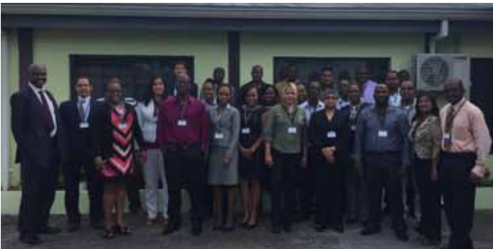
Workshop on national border controls on LMOs for the Caribbean

An Asian Subregional Workshop on Strengthening Capacities for the Integrated Implementation of the Protocol, the Supplementary Protocol on Liability and Redress and the Convention from 6 to 10 November 2017, in Kuala Lumpur, Malaysia. Participants analyzed relevant national policies, laws and institutional frameworks, identifying opportunities, and thereby develop a draft national mainstreaming strategy that set out steps to achieve integrated implementation of biosafety concerns in a variety of sectoral and cross-sectoral policies, laws and institutional frameworks.